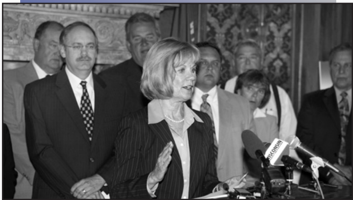
Sen. Darling announces legislation to provide GPS-tracking of dangerous sex offenders.