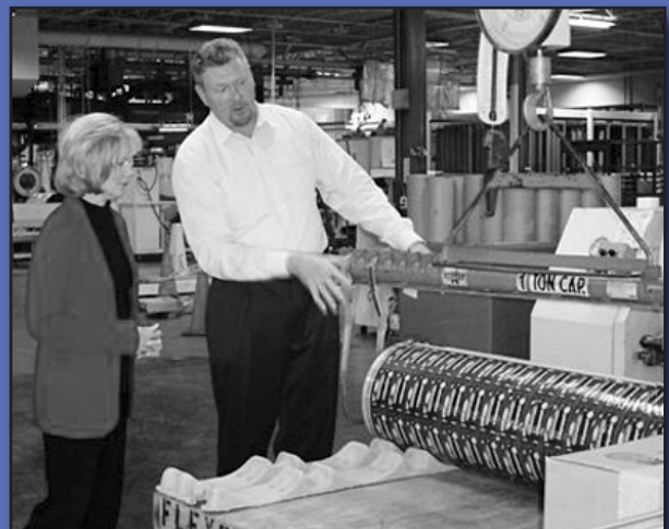
Sen. Darling tours Glenroy, Inc., a Menomonee Falls, family-owned flexible packaging converter.