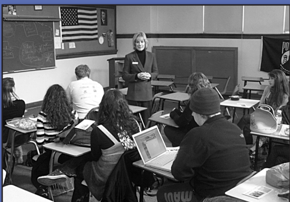
Sen. Darling speaks with local middle-school students.