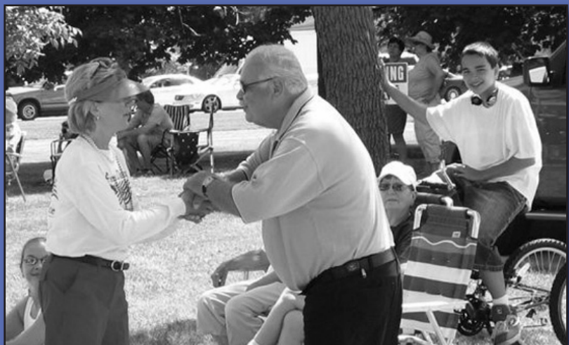
Greeting constituents on the July 4th parade route.