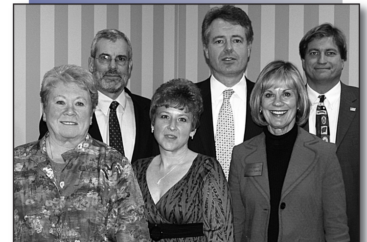
Sen. Darling was among those awarded for "exceptional work serving seniors" by the Coalition of Wisconsin Aging Groups.

The Stay in Wisconsin plan will also make all student loan interest 100% tax deductible to limit the "brain drain" by retaining the best and brightest college graduates to work and raise a family in Wisconsin.