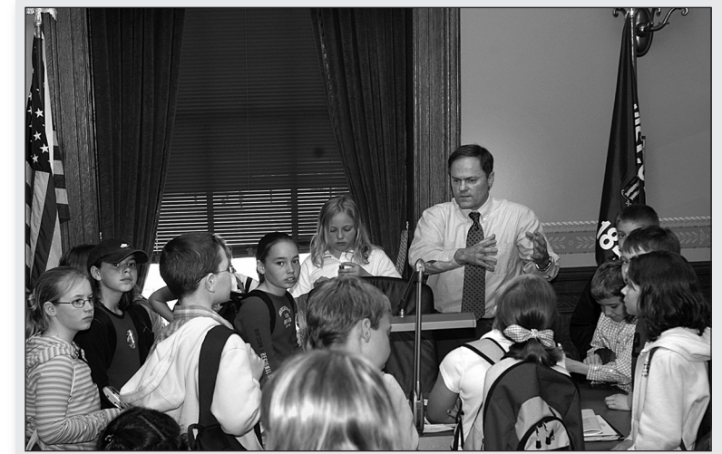
Sen. Cowles discusses the legislative process with a school group from the Second Senate District.