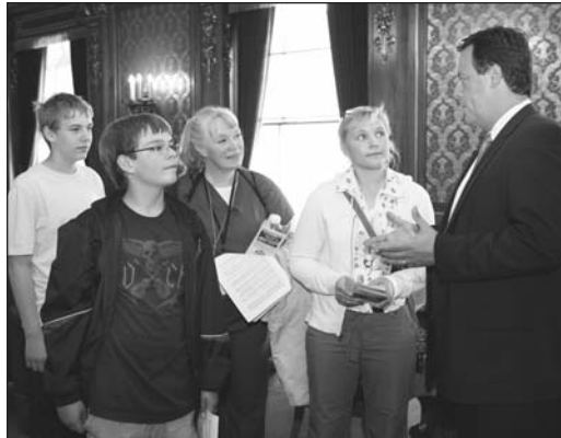
Students and teachers from Hartland's Woodland Academy visit with Representative Newcomer in the Assembly Parlor of the State Capitol.