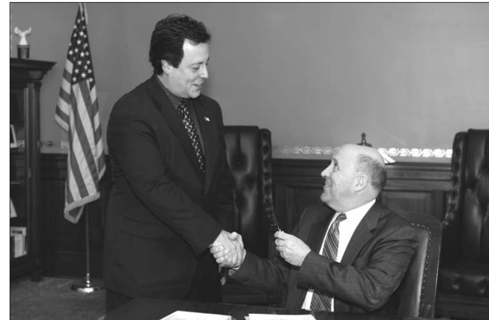
In bipartisan fashion Governor Doyle signs Representative Newcomer's Assembly Bill 409 into law.

AB 760 has passed both Houses and is currently awaiting the Governor's signature.