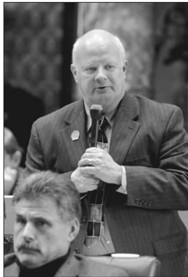
Rep. LeMahieu addressing members of the Assembly.

The compromise budget was better but still problematic. It contained too much spending and also a $200 Million raid of the Patients Compensation Fund. Because of the spending and now decreased revenues we have to now return to the budget five months after we passed it to repair it.