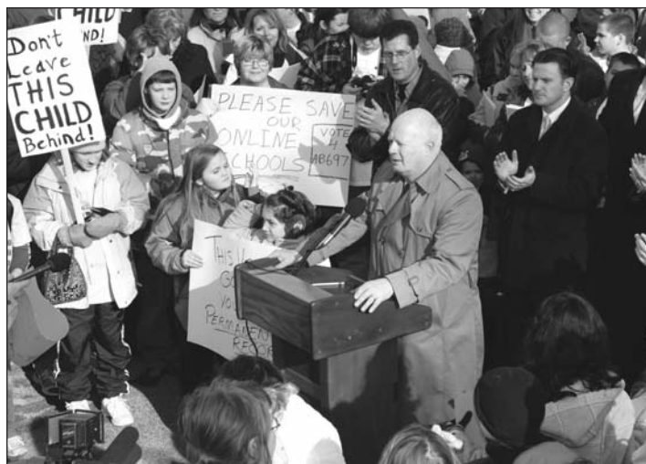
Rep. LeMahieu speaking at the virtual schools rally.