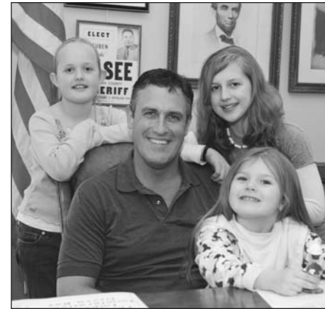
Frank's daughters visit the Capitol.

I believe it is vitally important that we focus our efforts helping our businesses and the families they employ to thrive without the burden of over-regulation and over-taxation.