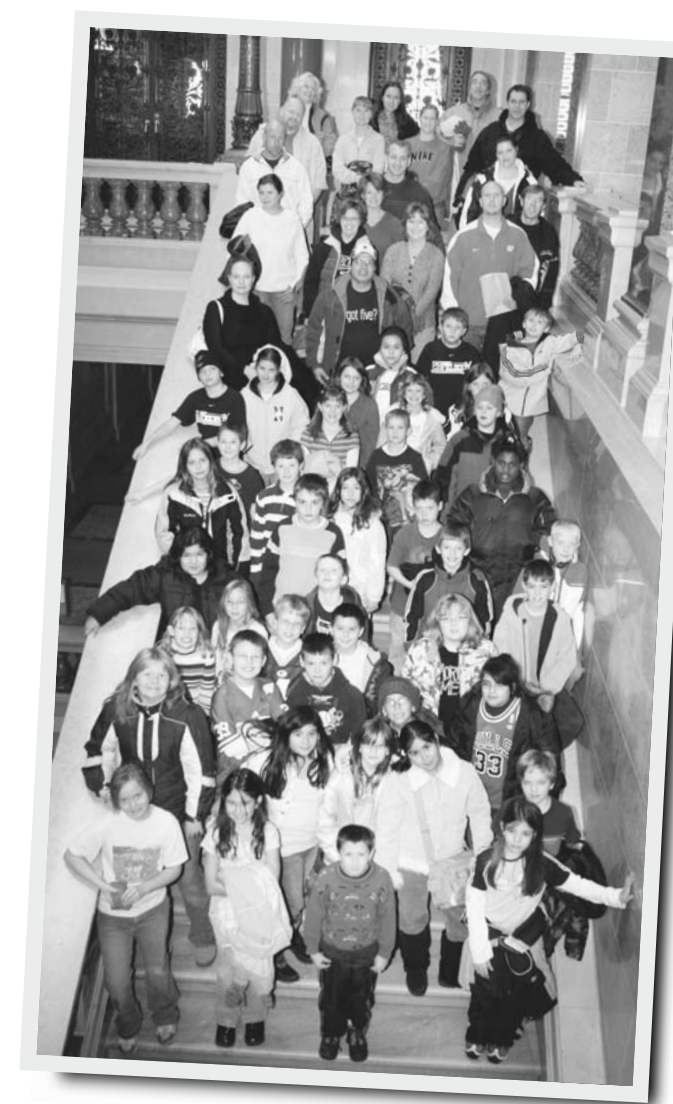
Hawthorne School's 4th Grade Classes

This is yet another common-sense proposal that will help voters who feel disenfranchised to once again have faith in the election process and feel that their vote is secure from theft or fraud.