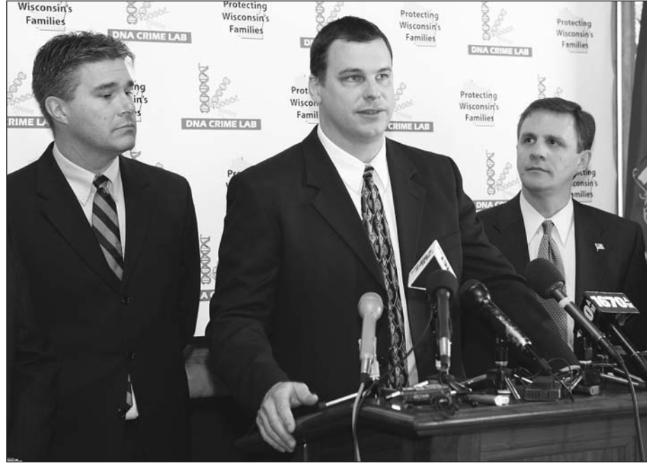
Representative Gundrum speaks at a press conference with Attorney General J.B. Van Hollen (left) and Assembly Speaker Mike Huebsch (right) prior to the Assembly passing legislation designed to eliminate the DNA backlog at the State Crime Lab.

2,000 cases. The State Crime Lab is the place where forensic evidence—including DNA evidence—is analyzed to aid in criminal investigations and prosecutions. More than half of the backlogged cases—nearly 1,000—were in Milwaukee and Waukesha Counties alone. Each backlogged case represents a potentially dangerous criminal that needs to be taken off the streets as soon as possible. Each case also represents a victim who is still waiting to bring closure to her or his ordeal in order to move on with her or his life.