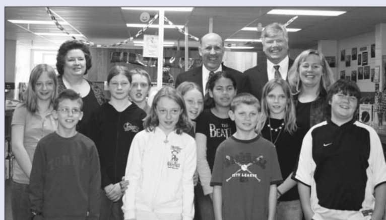
Don Friske and Governor Jim Doyle meeting with Washington Elementary teachers and students to discuss the needs of rural schools

SAGE Funding: Don Friske voted to fully fund the program to reduce classroom sizes in Wisconsin schools with $26.7 million. SB 40