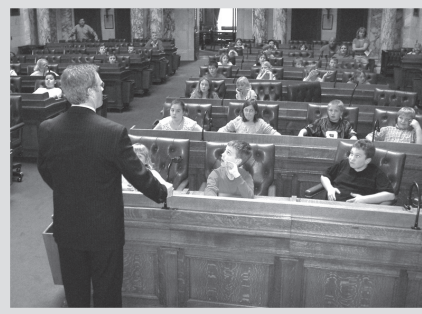
Rep. Fitzgerald speaking to a visiting school group in the Assembly Chamber.

Come visit me at the Capitol! To arrange a free guided tour call (608) 266-0382