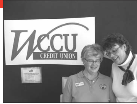
Reedsburg Fall Festival