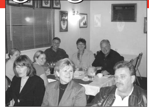
Richland County Farm Bureau