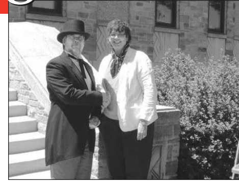
Juneau County Sesquicentennial