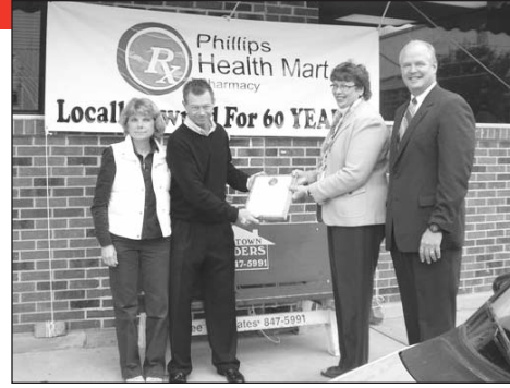
60 Years in business in Mauston