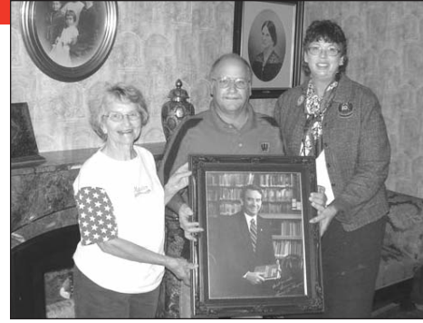
Juneau County Historical Society