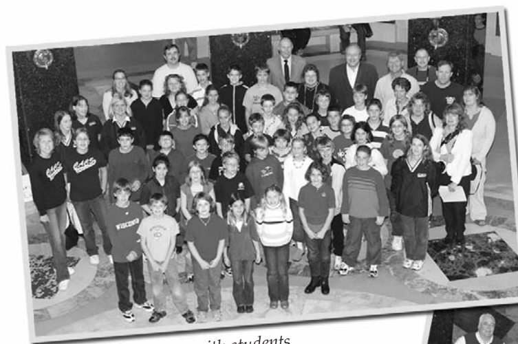
Rep. Ott & Sen. Lasee with students from Chilton Area Catholic School.

During your visit to Madison, you are invited to stop by my Capitol office. To schedule a visit, contact my office at 1-888-534-0003 .