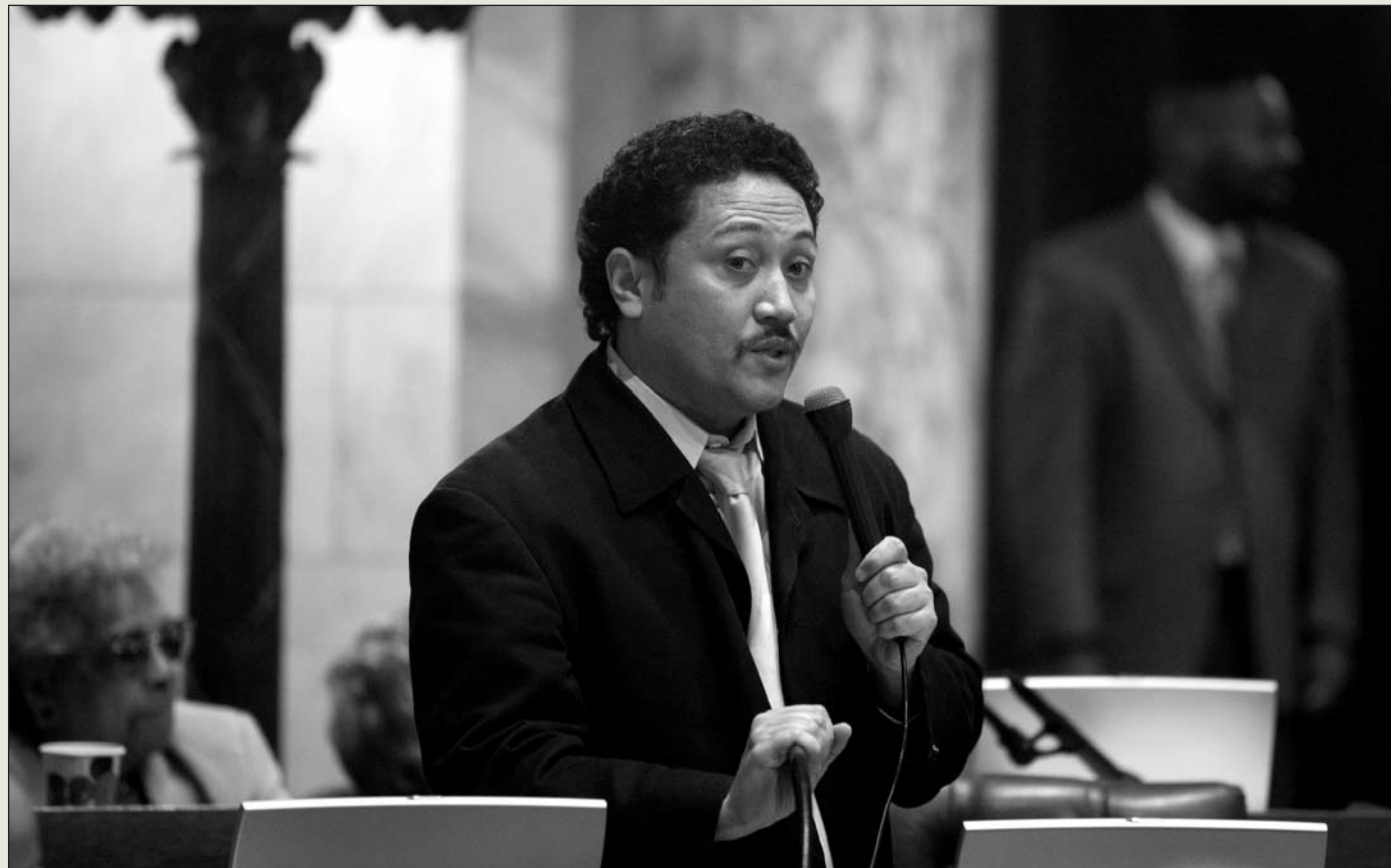
Rep. Young fights for the residents of Milwaukee during heated budget debate on Assembly floor.