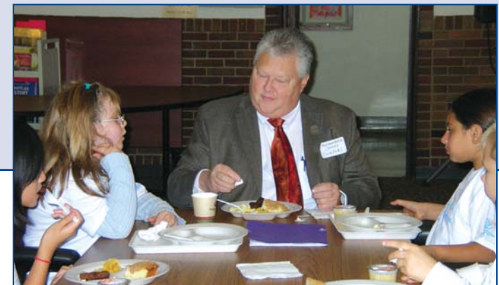
Last month, Representative Soletski joined grade school students for the Breakfast of Champions celebrating the Lights Out Afterschool program.