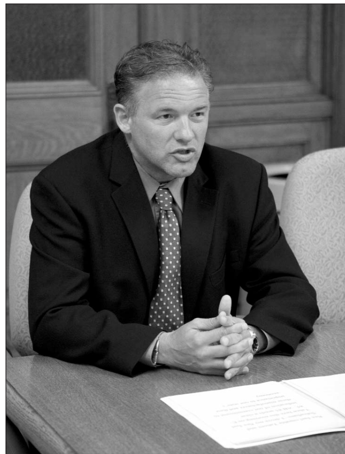
Rep. Sheridan testifying on the need for energy independence.

Currently, one of every 150 children born in the U.S. is diagnosed with autism. While the cause is not yet known, the levels are reaching epidemic proportions. Under current Wisconsin law, insurance companies are not required to provide coverage for autism treatment to policy holders. As a result, children with autism often do not receive the treatment they need until they are in public schools. By then, treatment is more expensive and less effective. I am a cosponsor of a bill, recently passed by the State Senate, to require insurance companies to cover autism spectrum disorders. This bill will save taxpayer dollars in our educational system and greatly improve the quality of life for children with autism. I am a coauthor of a similar bill to require insurance companies to cover cochlear implants for children with severe hearing impairments. With cochlear implants, some children who are born with deafness can have normal hearing. Both bills stalled in the Republican-controlled State Assembly