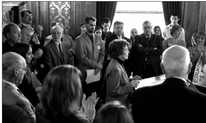
Rep. Pope-Roberts speaks to more than 200 supporters at a school funding reform press conference.

I am optimistic we will see even more discussion and movement on school funding next session and look forward to working with my colleagues to ensure all students, no matter where they live, receive a sound education.