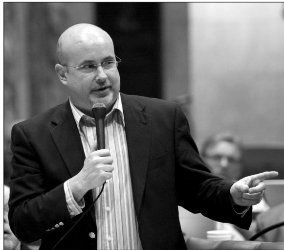
One of the most vocal progressive Assembly legislators, Representative Pocan frequently speaks about social justice issues on the floor of the State Assembly.