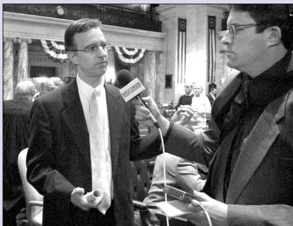
Representative Parisi discusses the Governor's proposed budget with a reporter.