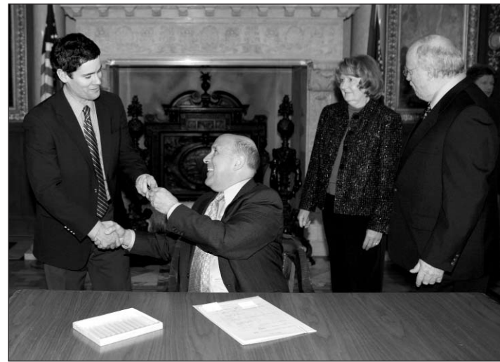
Rep. Molepske and district residents witness Governor Doyle sign AB 500 into law.

Constituent opinions are the most valuable source of information and ideas I have available to me. The following section contains several examples of bills that I drafted, introduced, and in many cases, were signed into law because of your suggestions. I want to thank all of the individuals who took the time to work with me on their ideas.