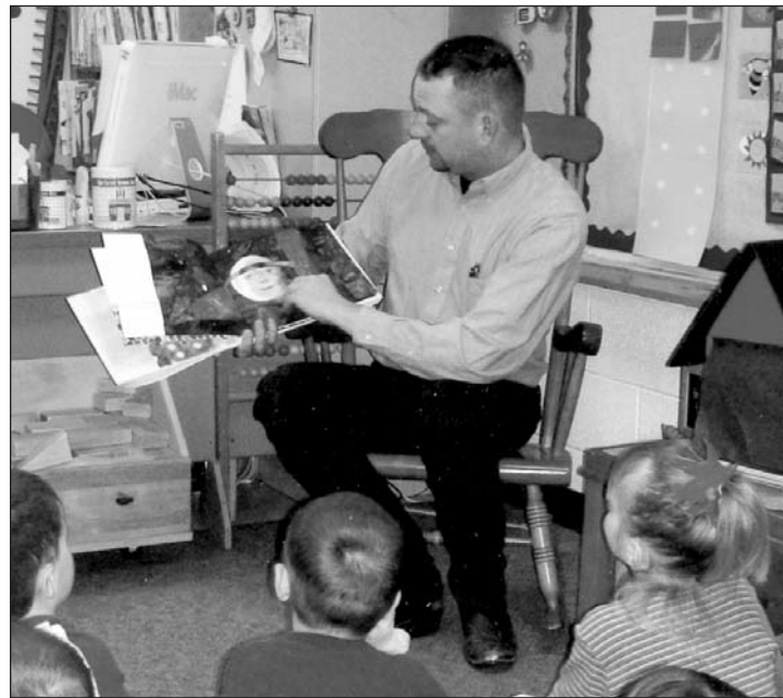
Phil reads to students at O. E. Gray Early Learning Center while touring schools in Platteville.

The Budget that initially passed the Assembly, despite bi-partisan opposition, made major cuts to K-12 funding. The budget proposed slashing close to one million dollars in aid to school districts in the 49th Assembly District including; Boscobel, Cuba City, Lancaster, Platteville, Potosi, River Ridge, Riverdale, and Southwestern. Through months of bitter fighting I was able to preserve funding for our schools, and restore the state funding our kids deserve in the final version of the state budget.